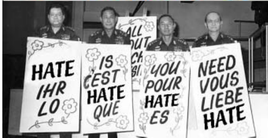
From left: Than Shwe, Maung Aye, Thura Shwe Mann and Their Sein. For updates on Burma, visit The Irrawaddy News Magazine: http://www.irrawaddy.org/